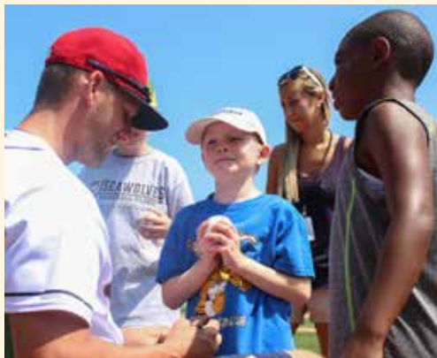
Youngsters and adults had time to get autographs and meet the players.

In addition to the instruction provided at the Clinic, each participant received a t-shirt, certificate and a ticket to an Erie SeaWolves game.