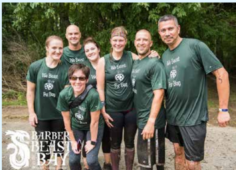
The team "beasts for Bug!"