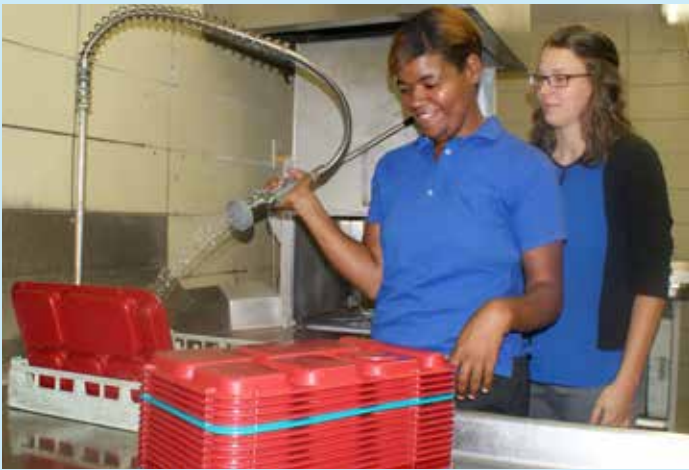
Supported Employment staff work with high school students to offer job shadowing experiences.