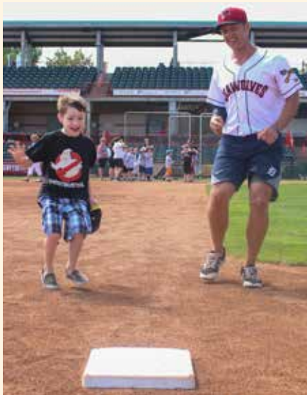
Erie SeaWolves players and coaches provided hands on instruction in batting, catching and running the bases.

The Barber National Institute, the Erie SeaWolves, and the Siebenbuerger Club came together to provide day-long day baseball clinics at Jerry Uht Park. Nearly 50 adults in day and residential programs participated in a clinic on July 18, while children in Connections Camp, a recreational program for youth ages 5 – 17 with high functioning autism and Asperger Syndrome, enjoyed camp on July 19.